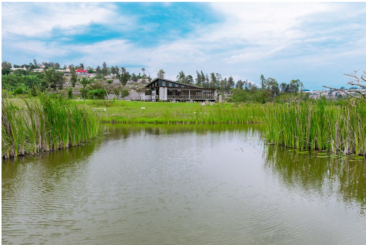
The existing Murindi Eco park

These include: The Gikondo wetlands located in Rwandex, Rwampara and Nyabugogo, Gacuriro, Mulindi and Masaka wetlands- which will be worked on to the same level as the recently completed Nyandungu Eco-Tourism park.