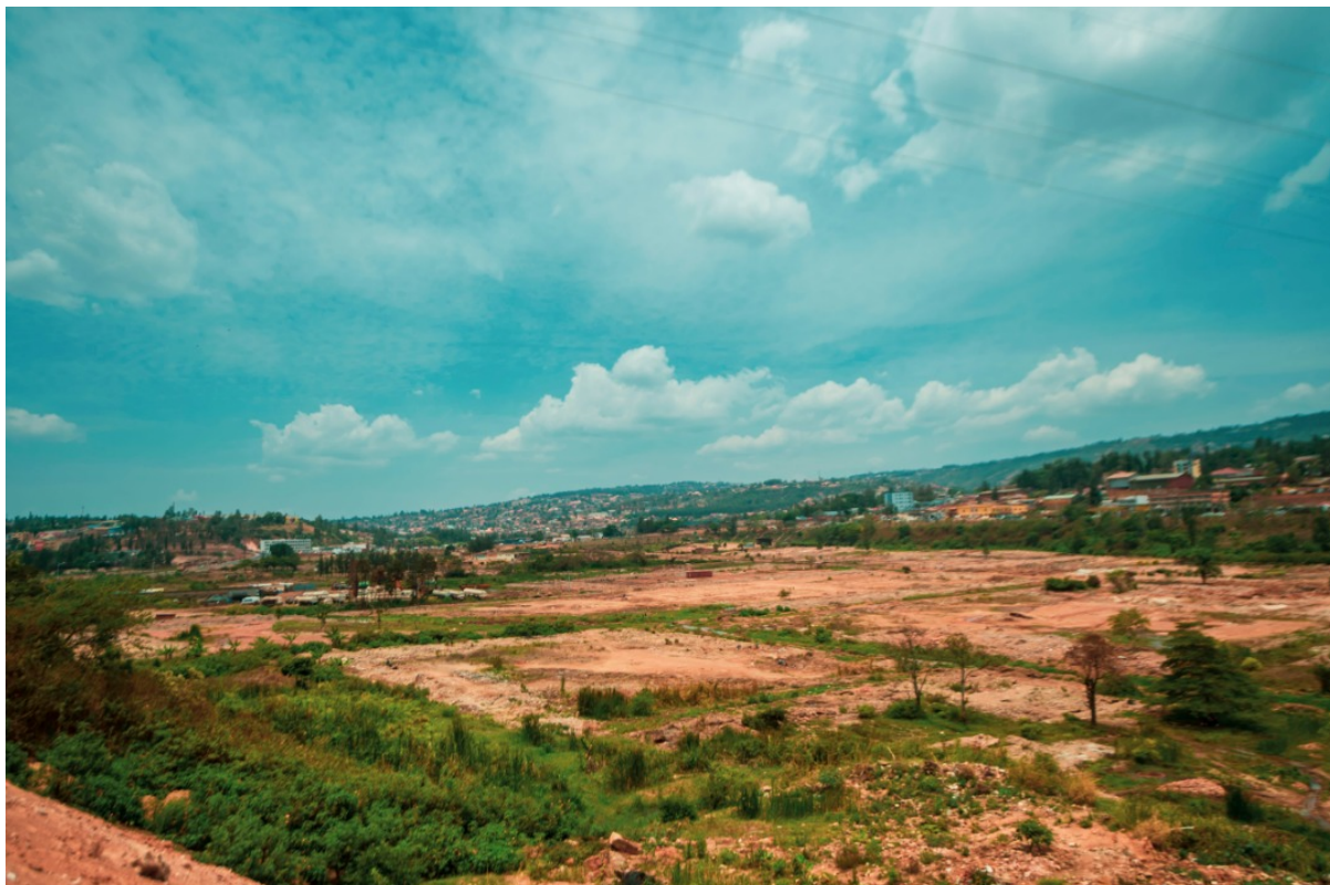
Gikondo marshland

Government is expected to contribute counterpart funding (CF) of an equivalent $ 15 million for the financing of resettlement and compensation of anticipated project, affected persons and property (PAPs).