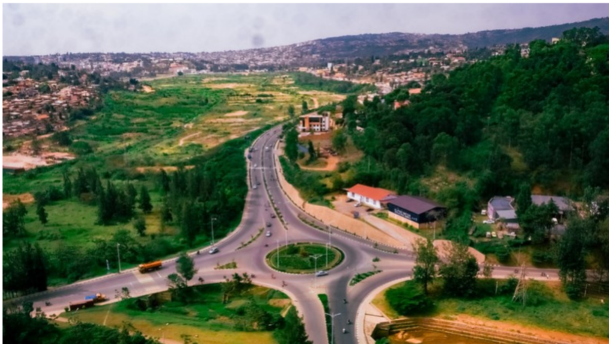
Gikondo marshland where industries relocated from, pending rehabilitation of the wetland

After managing to evacuate business activities inside the Rwandex wetland, REMA and the City of Kigali have embarked on rehabilitation and restoration of green life in this area which was occupied by several businesses including factories. These designated areas have been known to be affected by flooding due to poor and lack of proper water management (up and downhill).